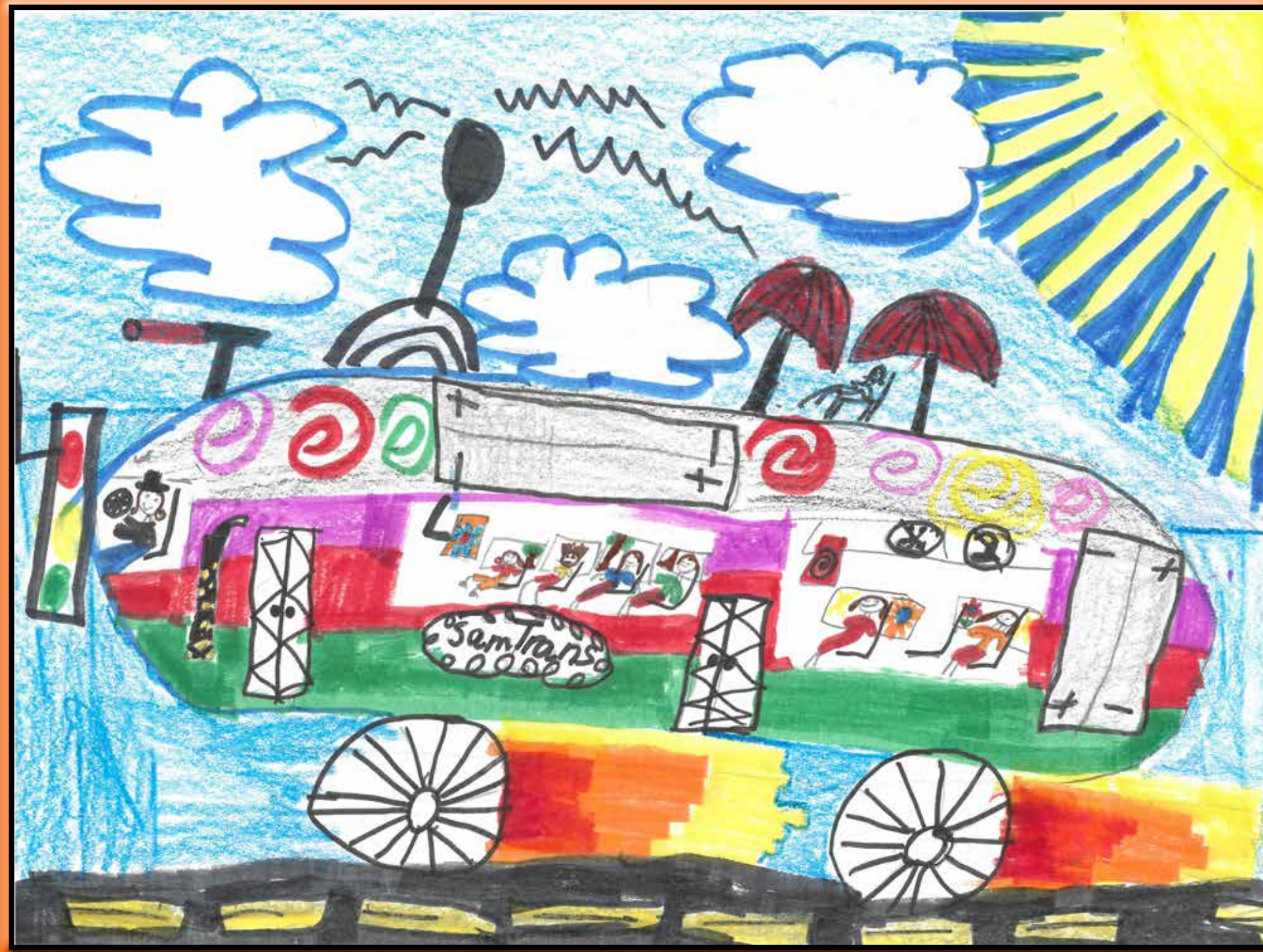
Emilia Lee, 1 st Grade Central Elementary, Belmont