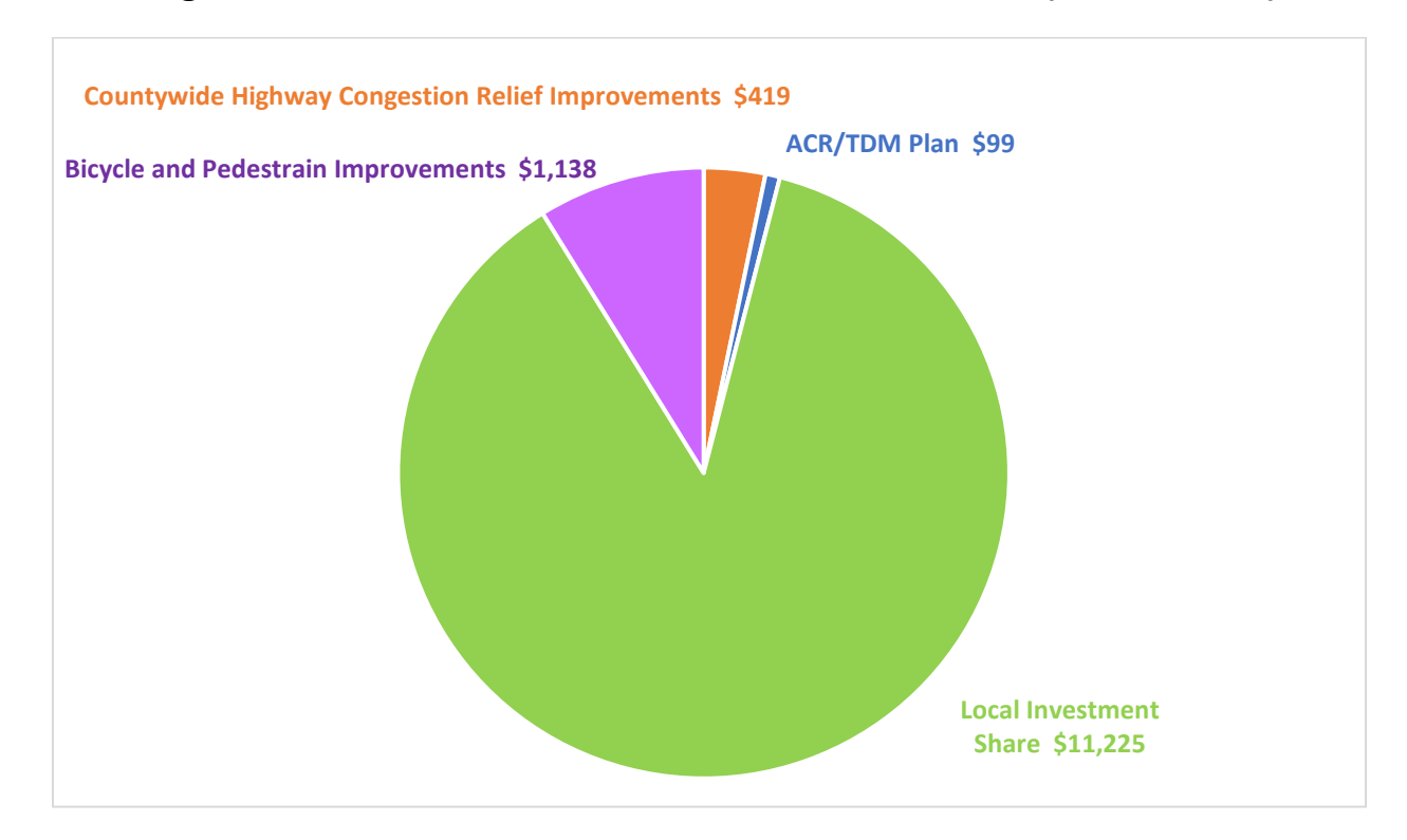
Figure 3. Fiscal Year 2022 TA Measure W Distributions (in thousands)

Date Source: Fiscal Year 2022 Audit Report