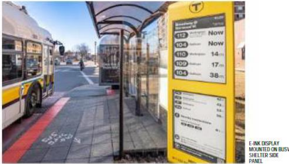
MBTA E-Ink Display