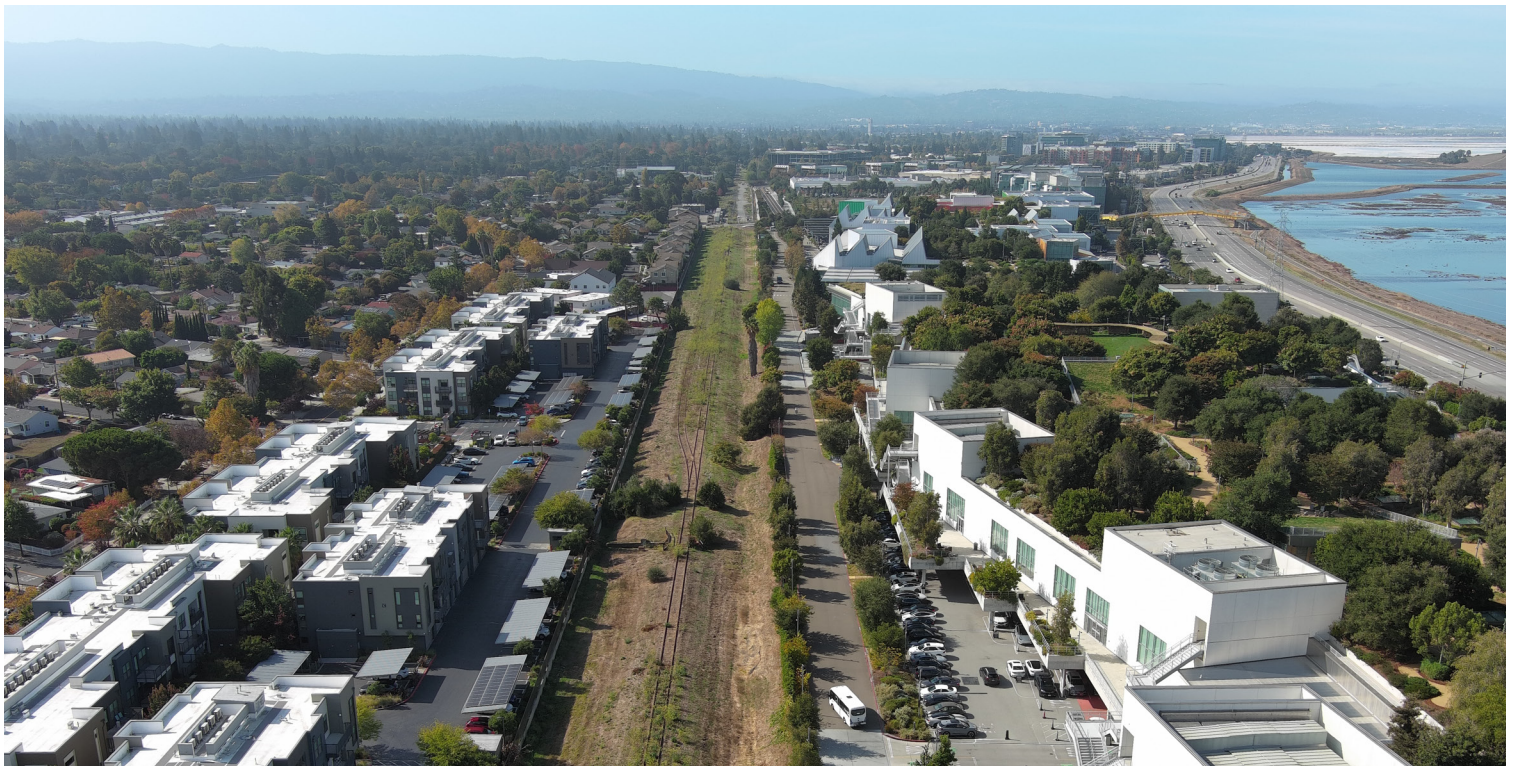
State of Dumbarton Corridor, 2025