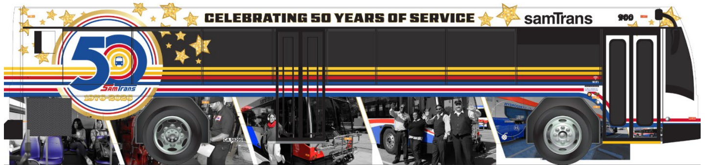
Bus #2 – in service end of June