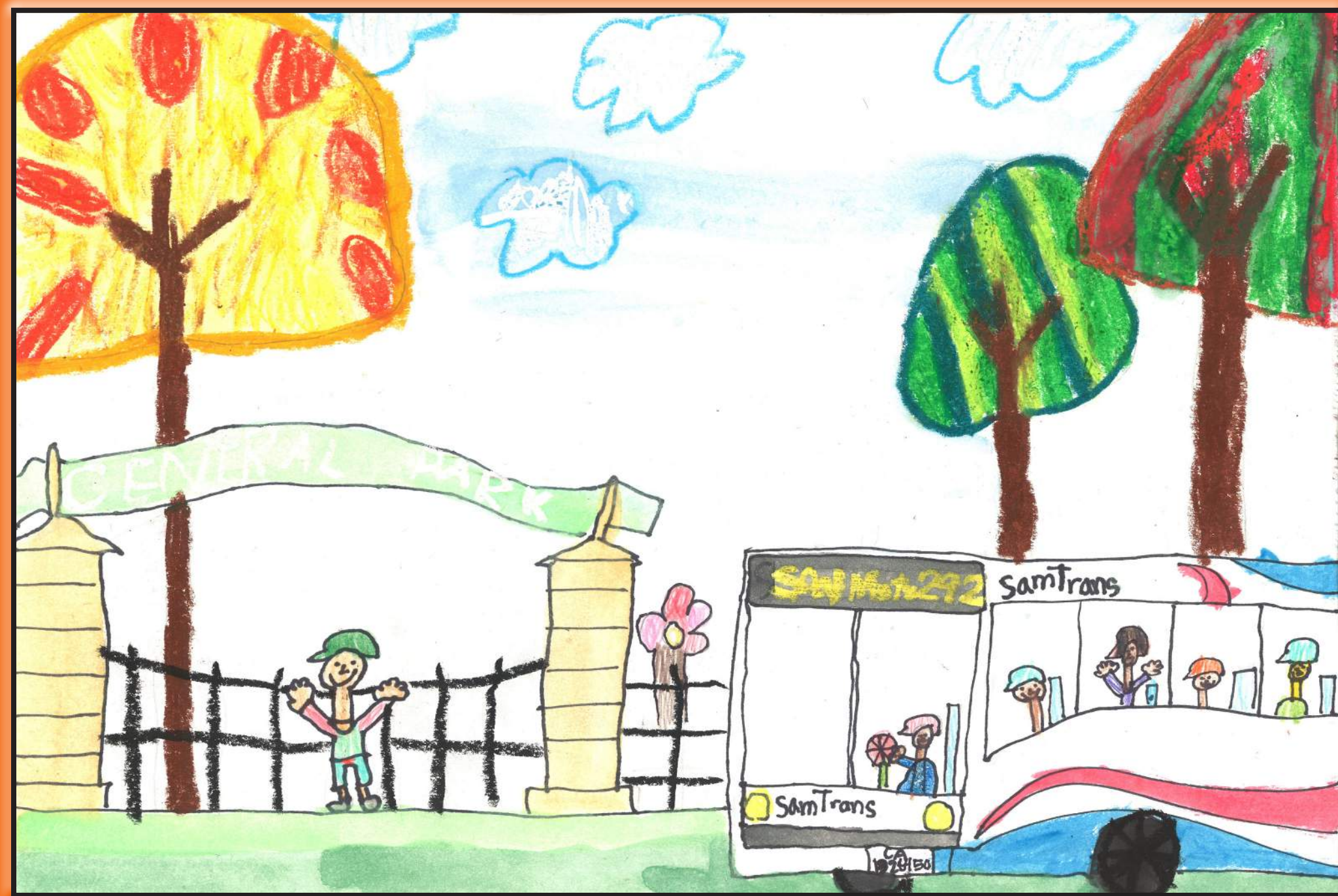
Myles Hu, 2 nd Grade Sandpiper Elementary, Redwood City