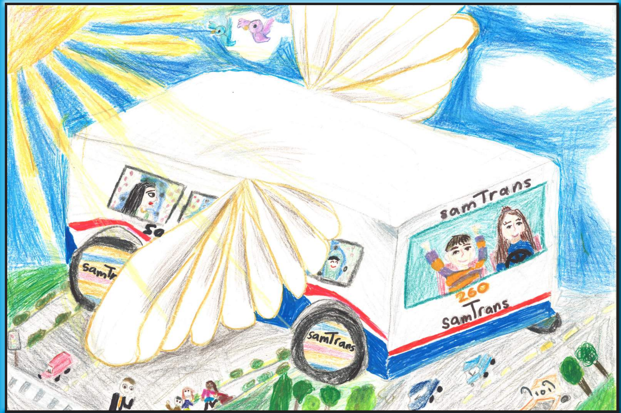
Emily Jiwon Hwang, 3 rd Grade Sandpiper Elementary, Redwood City